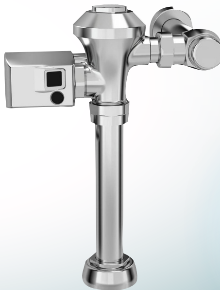
Webb # 754106 MFR # A/S6147SM121.002